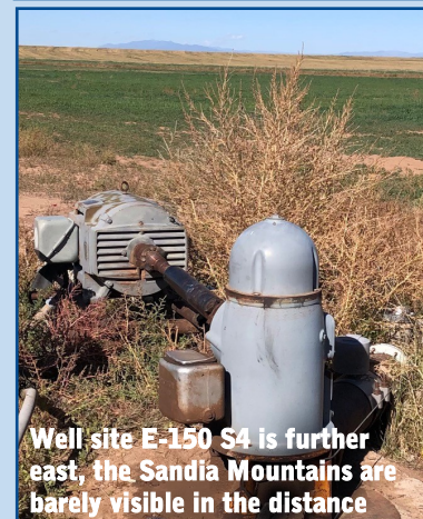
Well site E-150 S4 is further east, the Sandia Mountains are barely visible in the distance