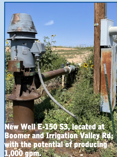
New Well E-150 S3, located at Boomer and Irrigation Valley Rd; with the potential of producing 1,000 gpm.

Entranosa's newest well, the East Pine Canyon, started out the same and was gradually converted to a domestic use well. In the next several months the new wells will be video inspected and test-pumped to determine water draw down. In order to qualify for a 40-year well, the wells can't draw down more than 4 ft in 40 years. Entranosa feels these wells could qualify as 70-year wells. These wells are expanding our capacity.