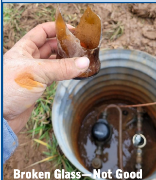
Broken Glass— Not Good

Entranosa's field crews face a difficult job on a daily basis, especially during the winter. Please don't make their jobs more difficult by booby trapping – intentionally or not – the area in and around the meter can. Either of