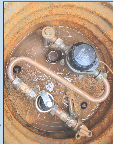
Water in the Meter Can - Not Good

these scenarios could have caused an injury to our operators. Please don't get into our meter cans - call us for help.