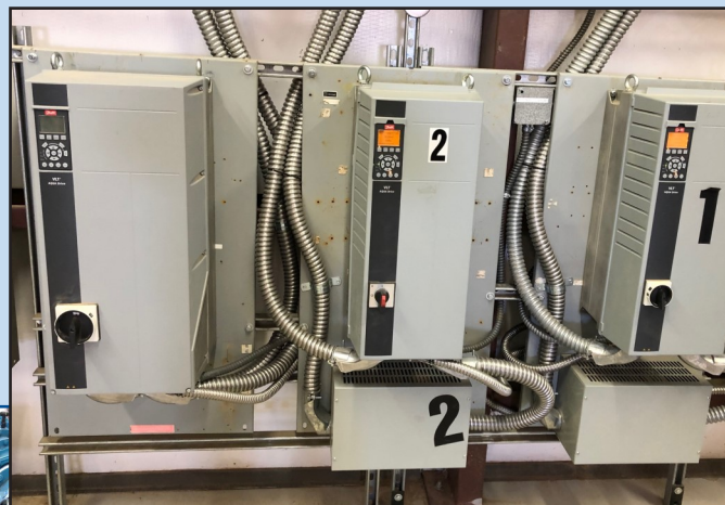
Electrical Circuitry Ready to Go