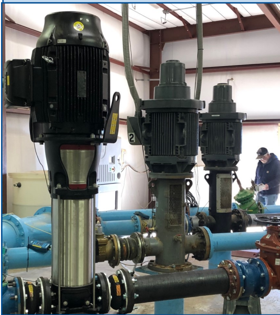
Left, New Pump Installed

Like the rest of the United States, Entranosa has experienced significant challenges receiving critical equipment. Case in point— the third pump for the Frost Road booster station. Recently this crucial equipment was delivered and installed.