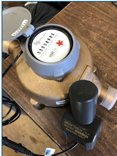
Replacement cell transmitter

Entranosa's older 2G and 3G cell meter transmitters are slowly turning into "senior citizens." Entranosa was recently notified that more meters will not work due to outdated technology starting in 2023. The only consolation is the manufacturers are offering a 60% discount on the transmitters. The cost they are offering does not include the labor costs to replace them, however. Entranosa will inform members if their meter transmitters are on the list to be replaced.