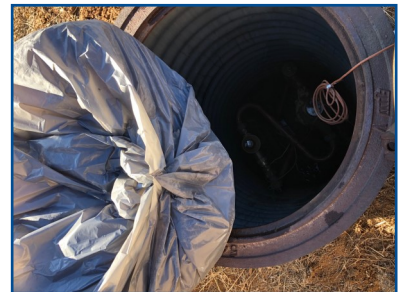
Replace Can Insulation

This winter, Entranosa crews have been busy with frozen meters. Most of the freeze problem result from members leaving their meter can lids off or removing the insulation blanket. This additional insulation is critical. If you do get into your meter can, please replace the insulation blanket so there are no gaps around the can edges. We also recommend when temperatures are in the low digits, let an indoor facet drip to keep the water flowing.