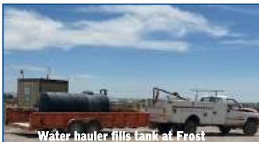
Water hauler fills tank at Frost

almost empty. In fact, it's just the opposite – the target at the bottom means the tank is almost full. Entranosa has spent more than $400,00 in capital investments since January to prepare for the seasonal high demand and we are ready.