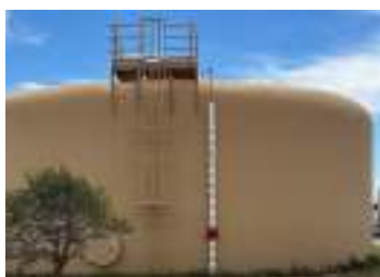
Red indicator shows tank is almost full