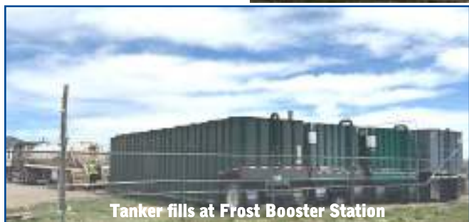
Tanker fills at Frost Booster Station