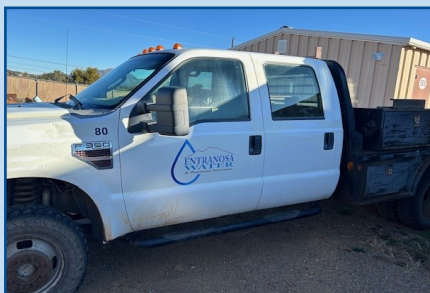
2007 Ford F-350 truck

Entranosa has a surplus 2007 Ford F-350 truck for sale. The truck has a blown lower end 6.4 power stroke engine with 235,000 miles on it. Minimum bid is $3,500 based on the value of the flatbed and new tires. Only members and staff may bid on