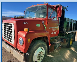
1981 Ford F-9000 dump truck, fully operational

truck is fully operational with 256,000 miles on it. Minimum bid is $10,000. Bid forms may be picked up at the office or pulled from the Entranosa website. Bids for either or both vehicles are due