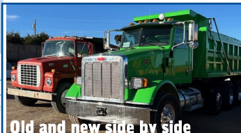
Old and new side by side

Entranosa just purchased a used 2014 Peterbuilt dump truck. The 1981 Ford dump truck has been a good truck but it was limited in capacity, which forced us to contract for dumping high volume loads. The new dump truck will be able to haul a full 15-plus tons, plus haul a backhoe at the same time, saving both time and manpower. With its bright green color, you will definitely see it coming!