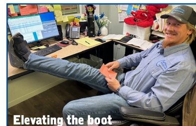
Elevating the boot